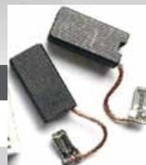
Auto cut-out version CB175