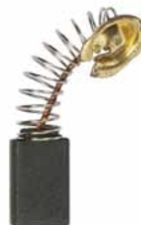
Auto cut-out version