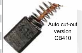
Auto cut-out version CB410