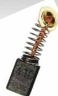
Auto cut-out version CB410