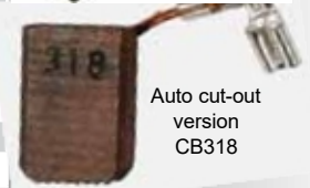
Auto cut-out version CB318