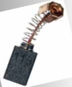
Auto cut-out version CB113