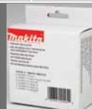
Service kit HM1801 / HM1810 195205-6