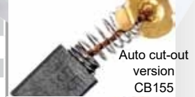
Auto cut-out version CB155