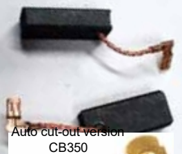
Auto cut-out version CB350