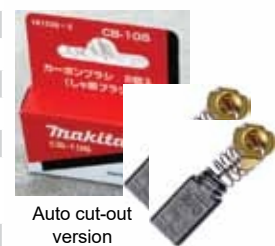
Auto cut-out version CB105